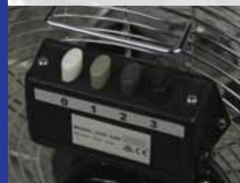
3-speed push button control