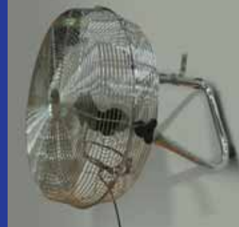
Tornado fan fixed to wall using supplied mounting bracket